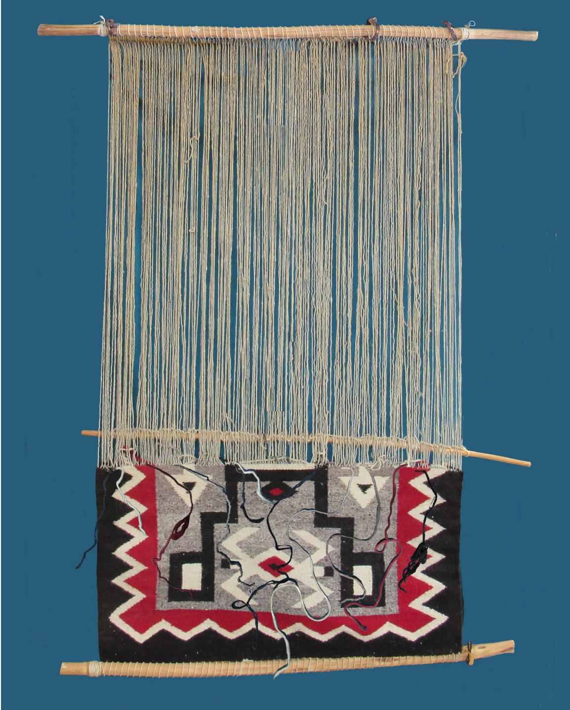
Frontispiece conceptualized by Shawn Wilson. Image © 2015 Tapestry Institute. Used with permission.