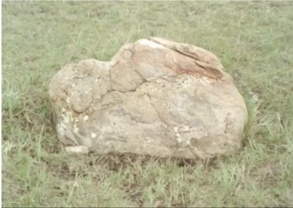
Buffalo calf rock at Sundial Butte.

Bruce, and they went to look at it together. Then he told Ryan, “Let’s look around on the ground around it here and see if maybe we can find some iinisskimm .”