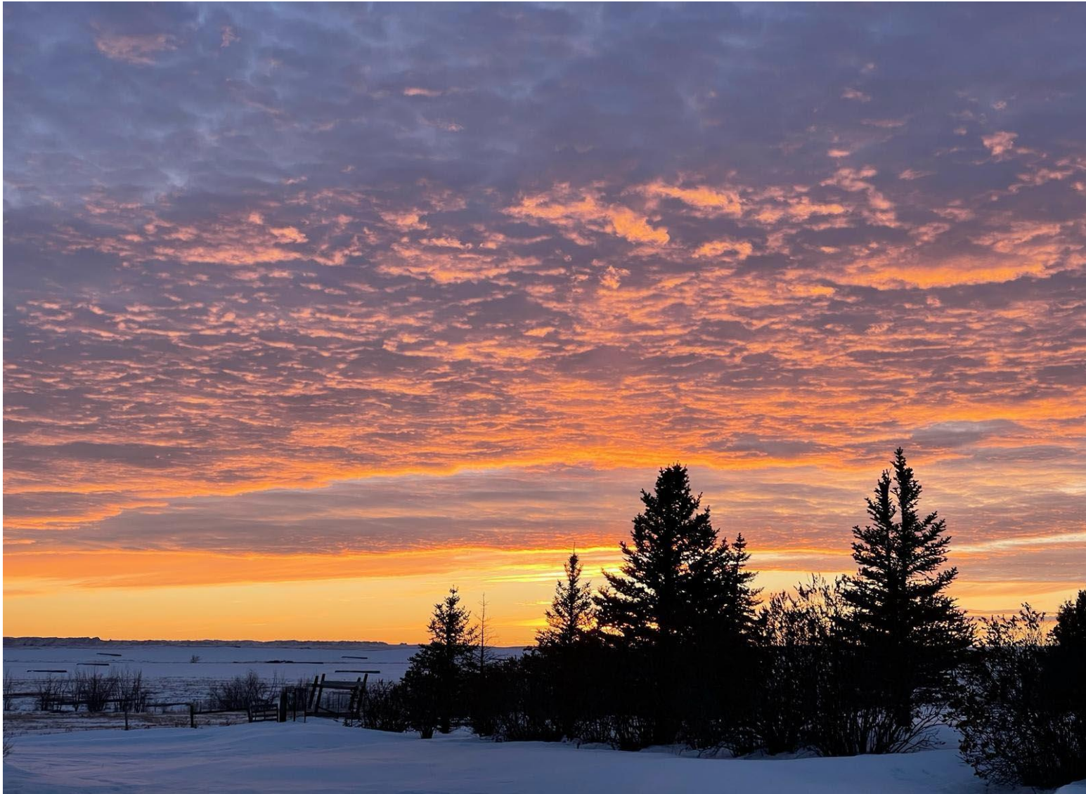
Sunset. January 24, 2024. Yakoke. We thank you for Knowledge.